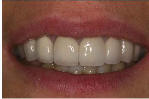
Figure 4: Full smile, after.