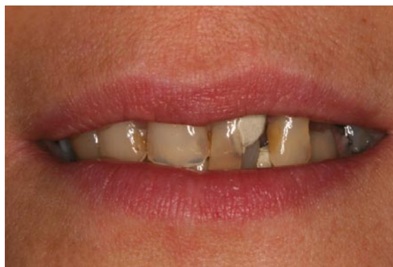
Figure 2: Full smile, before.

just to have her front teeth restored, so I called some of my colleagues to ask for their help; my goal was to give her back a complete smile. This would entail a complete maxillary arch rehabilitation from ##2-13; restorative treatment on ##22-27; and a new mandibular partial denture to replace missing ##19-21 and ##28-30.