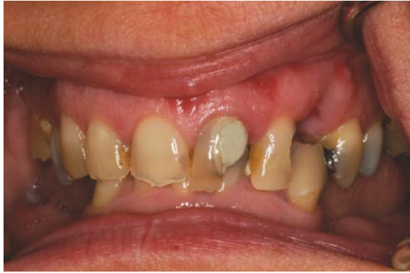
Figure 3: Retracted view, before.